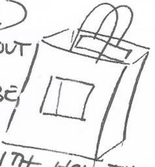
FIGURE OUT HOW BIG THE WINDOW CAN BE TAKING CARE NOT TO INTERFERE WITH HOW THE HANDLES ARE ATTACHED (IF THERE ARE HANDLES). THERE NEEDS TO BE ENOUGH OF A BORDER ON ALL SIDES TO STILL LET THE BAG STAND ON ITS OWN.